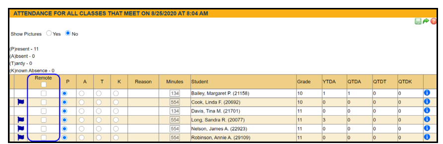
Group Attendance Using "Take Attendance Now" Feature

Once attendance has been saved, audit records will include the word "Remote" to indicate remote attendance entries.