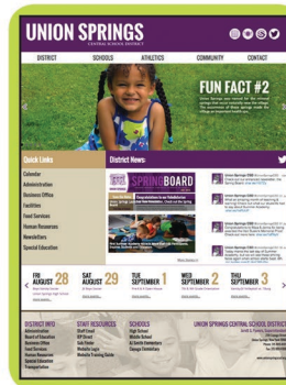
Union Springs Central School District's Award-Winning New Design

The CNYRIC won two awards in the website category for our work on the Union Springs School District website and our own CNYRIC website. Only five awards were handed out in the website category and the CNYRIC earned the top two spots with Honor ratings for both projects. The CNYRIC also won an award for our CNYRIC Connections e-newsletter. One of only three awards in this category, we received the highest distinction with an Excellence rating for our work on this publication. NYSPPRA will present all awards at the annual New York State School Boards convention in New York City. For more information about the e-Communications program at the CNYRIC, please visit: http://www.cnyric.org/e-communications