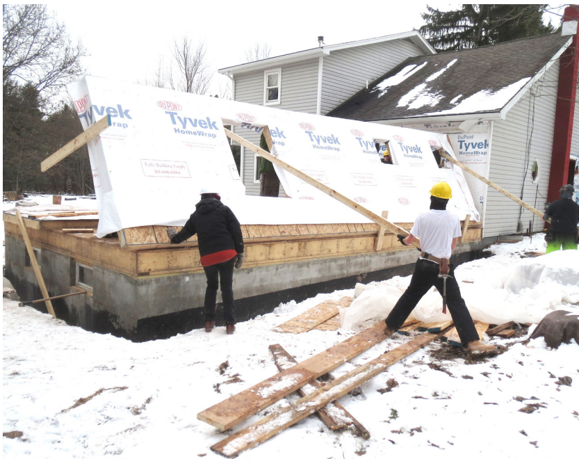
ESM Carpentry students are working on a master bedroom addition. Applications are being accepted for 2019-20.

ESM Carpentry program is now accepting applications for the 2019-2020 school year. Now is the time to start planning! Appropriate projects must be within the ESM school district and be sizeable enough to engage up to 20 students.